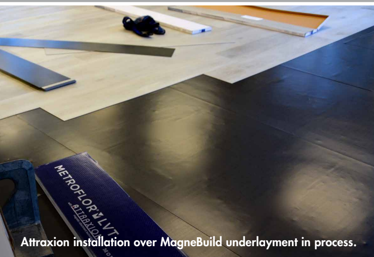
Attraxion installation over MagneBuild underlayment in process.